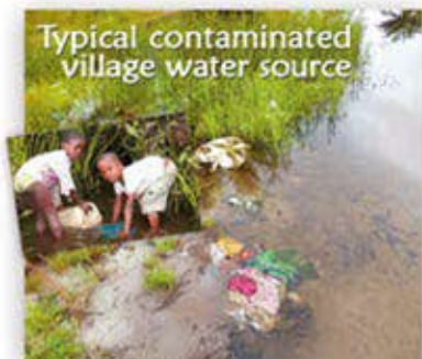
Typical contaminated village water source

In this village near the town of Buchanan, five hours from Monrovia, Liberia, every week children were dying of diarrhea, cholera and other water borne diseases and for years the people in this village had been asking Non-Government Organizations and the Government